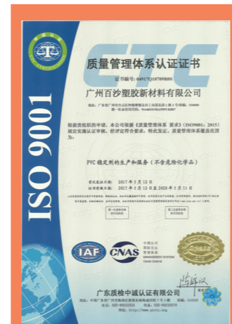
ISO 9001 认证证书